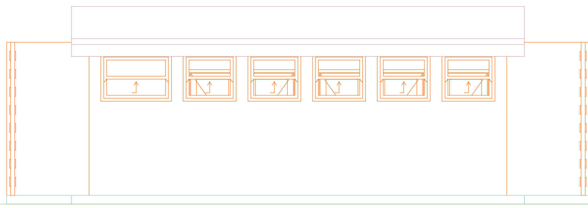
ELEVATION - 2 -